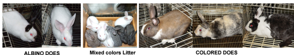
Figure 1 : Examples of rabbit colors

maternity building contained 80 single level mother cages. It was naturally ventilated and lit by natural day light. Temperature and hygrometry were not mastered. The animals were fed ad libitum with pelleted rabbit feeds (15% protein and 27% NDF) produced by the UAB SARL "Local production" company situated in Bouzaréah Algiers. Ad libitum drinking was made with automatic nipple drinkers. Weight at different times between birth and weaning was measured for 590 litters corresponding to 3965 kits born alive. The females were classified according to only 2 phenotypes: "albino" (true albino and himalayan coats) and all other coats classified as "colored" (figure 1). The females were mated the first time generally when 22 weeks old. The females whose pregnancy diagnostic was negative were presented to a male 12 days after the unfertile mating. The nest boxes were placed three days before the estimated date of kindling. The numbers of kits born alive and present until weaning were recorded. Litter weight at birth (kits born alive) was recorded for only some litter. Thereafter all litters were weighted twice a week at minimum between birth and weaning (at 28-30 days).