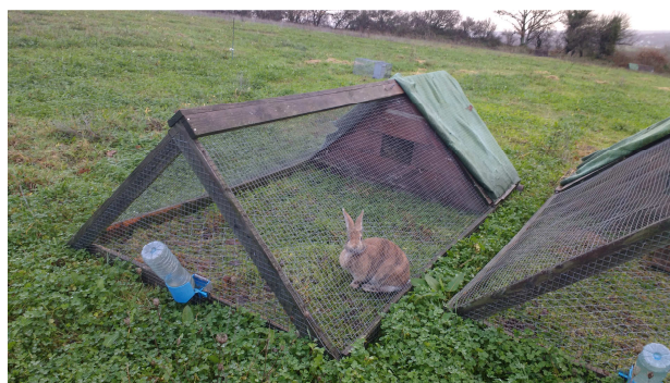
Figure 1: Movable cages on pasture for organic rabbit farming

The development of organic production is growing significantly since 2009. However, organic rabbit farming (ORF) remains a niche market in France (about 50 farms), and the consumer demand exceeds the supply (Roinsard et al. , 2016). ORF French specifications contain several rules and recommendations, such as whole year grazing, natural breeding, and slaughter after 100 days of age, housing in movable cages ( Figure 1 ) or in paddocks, and use of breeds adapted to grazing and adapted to outdoor management. In indoor conventional rabbit farming, the breeding performance is